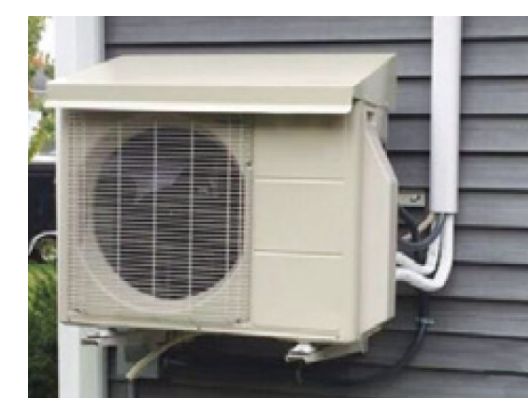
Proper placement: on brackets, insulated tubing, rigid line cover, wind baffle.