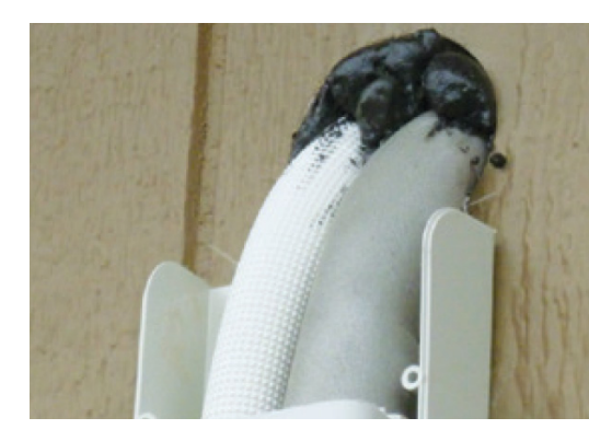
Be sure to air seal all wall penetrations.