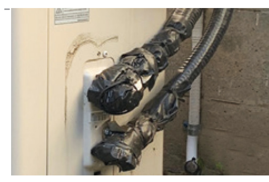
Ensure that the insulation is thorough and covers the entire line set, as shown here.