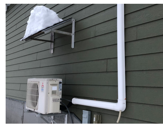
Proper outdoor placement, showcasing a drip cap/snow shield.